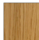
05 Oiled Oak