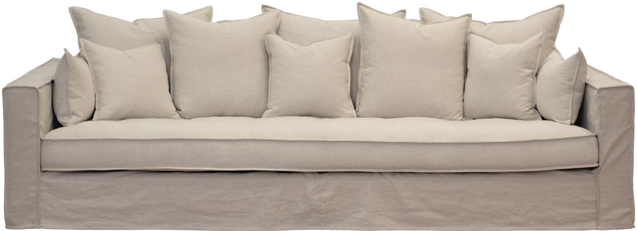
LINO 11231-04 STRING