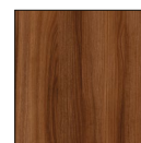
06 Oiled Walnut