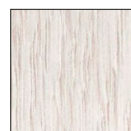
04 White Pigmented Oak